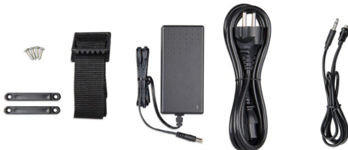
Fixing strap Adapter Power cable Push-button with cable (2m) and dual-colour LED