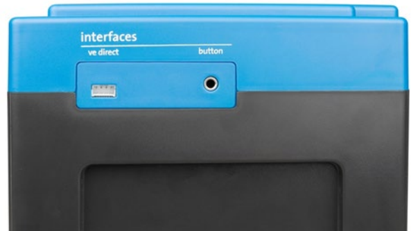
VE.Direct and push-button