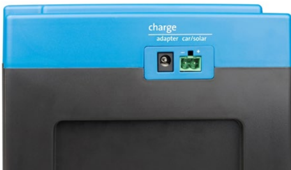
Adapter and car/solar inputs (plug for the car/solar input is included)