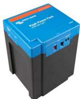
12.8 V, 40Ah