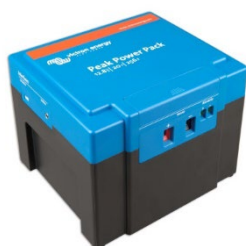
12.8 V, 20Ah