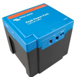
12.8 V, 30Ah