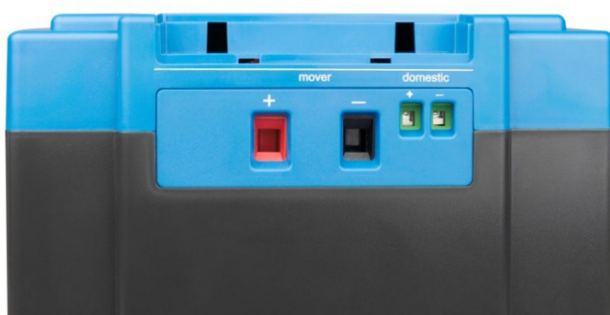
High capacity output (mover) and low capacity output (domestic)